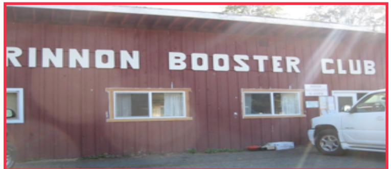
The Brinnon Booster Club facility will house the GIK warehouse for the area. This was the old fire station in Brinnon.