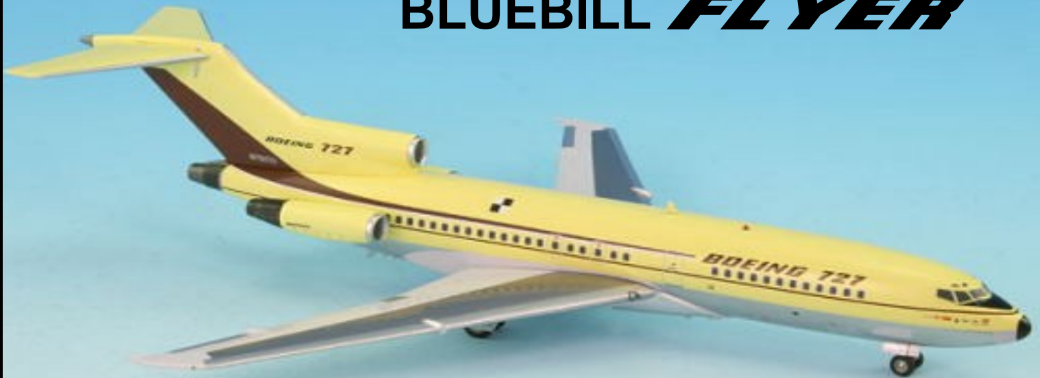
727-100 Rollout, 1962