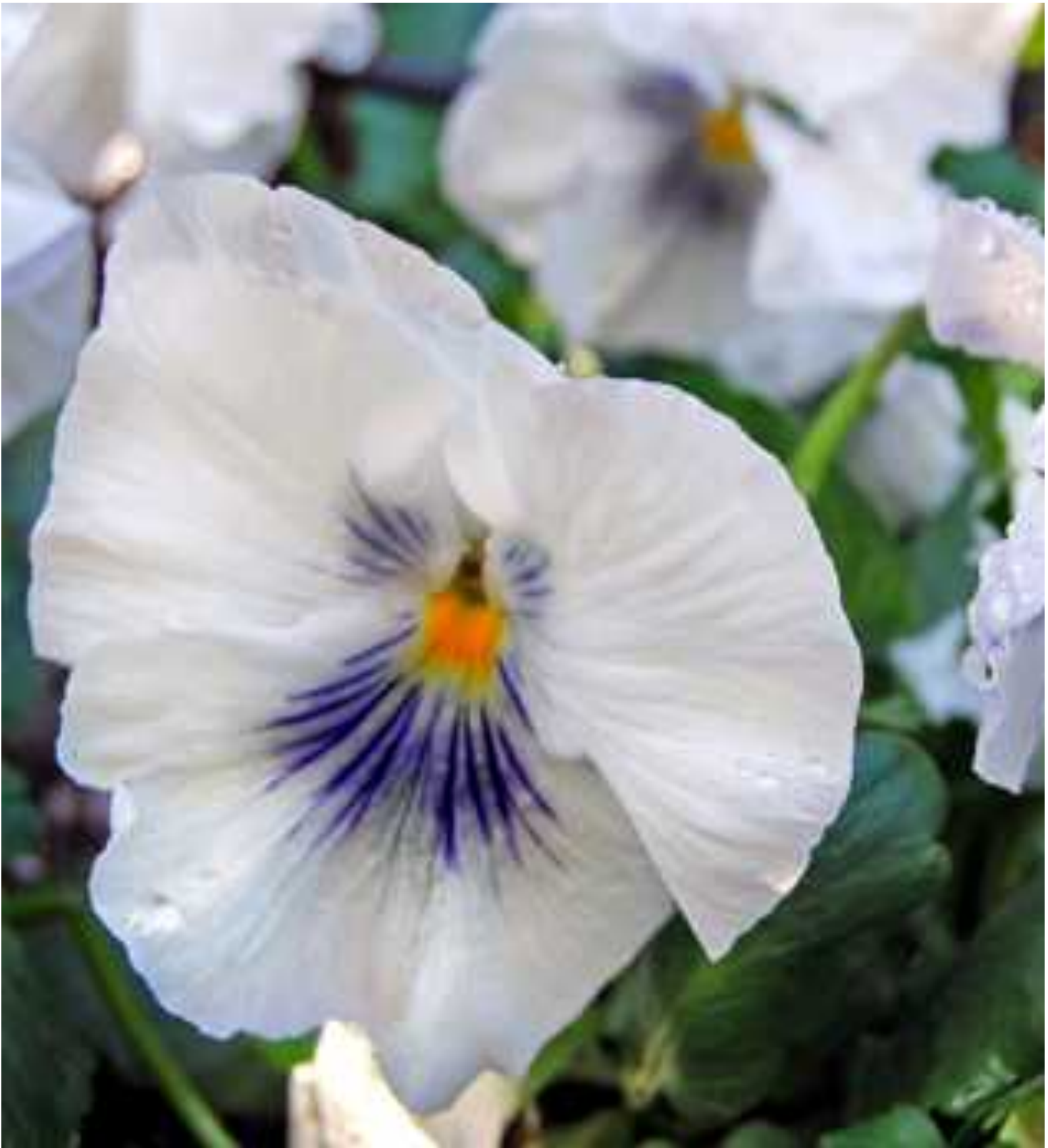
Take a moment to look into the little pansy faces.