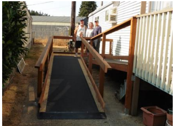
Bernie, Rusty and Bob Keever

At the request of Catholic Community Services (CCS), Kitsap builders made a rare border crossing to put in a ramp for a needy client in neighboring Pierce County. Masonic Outreach Services payed for the materials. Because of the distance (over 100 miles round trip), the ramp and platform sections were pre-built up here, then bolted together at the job site. The modular ramps can be fairly easily disassembled and reused, making them a good option when there's a temporary need, or a landlord who will want it removed. Construction plans for the modular wheelchair ramp can be found in the Olympic Peninsula Bluebills Independent Living Program Project Handbook, along with plans for the traditional site-built ramps.