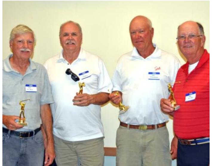
Golf Tourney Winners