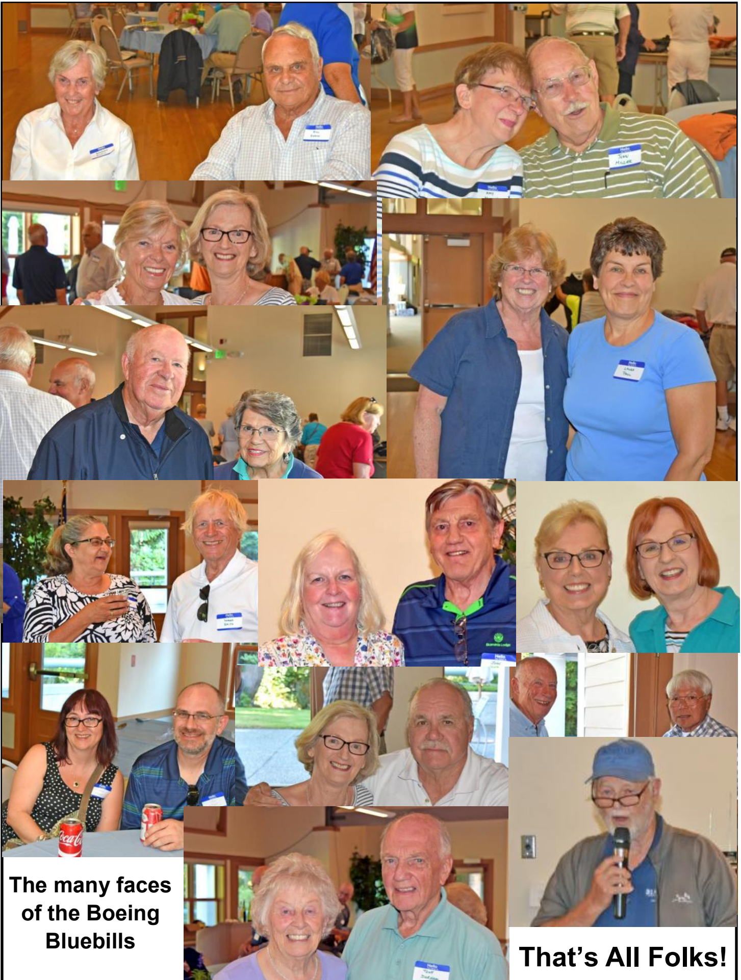
The many faces of the Boeing Bluebills