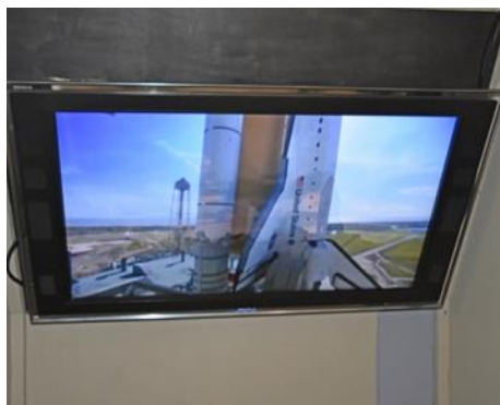
The video of the shuttle trip to the International Space Station

The Bluebills of the Olympic Peninsula have done it again! Second year in a row winning a Blue Ribbon for the Best Interactive Booth at the 2017 Jefferson County Fair, August 11-13! Our intrepid leader, Myron Vogt created a mini-space shuttle complete with a 4 minute video showing blast off and reentry of the shuttle.