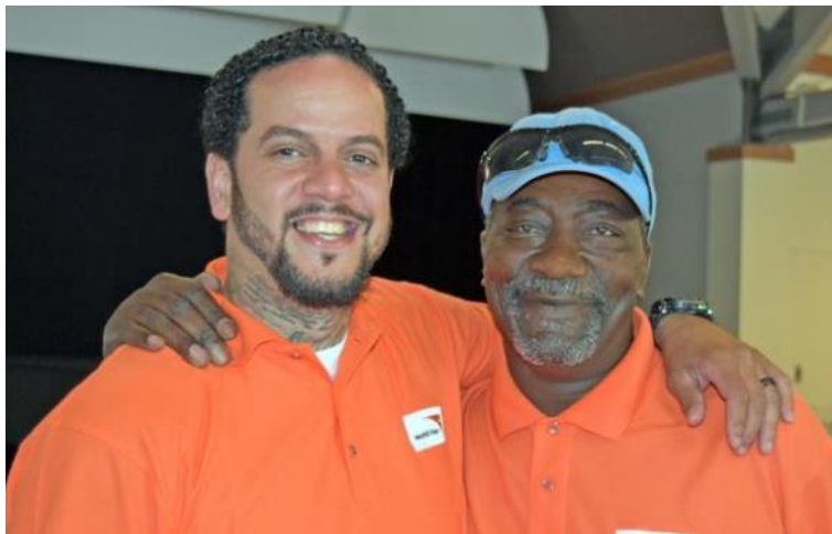
Our Guests from World Vision