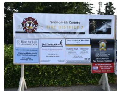
Sponsors of this year's tournament