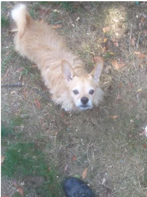
“Buddy” kept a close watch on us.

Bluebills responded. Wally Grenquist aggressively plunged and snaked out the drains in her house until things got flowing again. Then a $5 washer and proper seating of the upper heating element was all it took to get the hot water heater working again. Greg DeVault, our Kitsap Master Procurement Officer, located a gently used, matched set washer and dryer that someone was giving away on Craig’s List, and it fit the Client’s needs nicely. Now she feels like she is living on easy street, although all we did was raise her from a level of extreme poverty, back up to ordinary poverty.