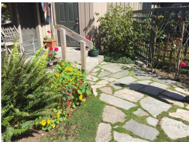
Before and After. Some rosebushes had to be moved to make room for the new ramp

The client is a determined man who goes to lunch most days at Don's Pharmacy. He had been throwing his walker down the stairs and following it down. Some kind and generous neighbors helped coordinate and pay for a ramp. No more throwing required.