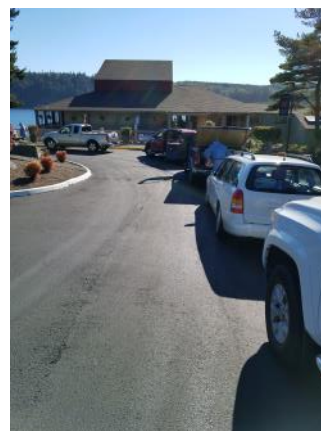
Arrival at the Beach Club