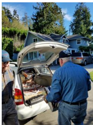
The crew arrives at the "storage facility" to move the books to the Beach Club.