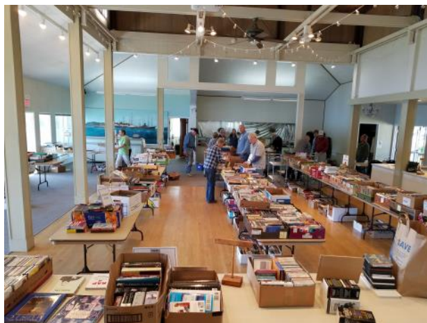
6600 books and media are set up and ready for the sale.