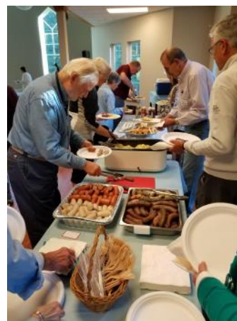
Tasty Oktoberfest fare