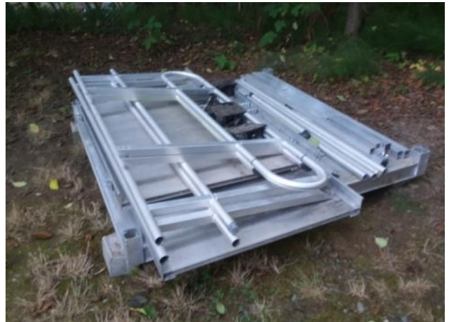
Remaining sections earmarked for 3 rd Client

We don't normally deal with aluminum ramps, which are expensive and lack the "solid feel" of the ones we build out of wood. However, when this 43' aluminum ramp with 3 platform sections was no longer needed in Bremerton, and we had clients on the waiting list who couldn't afford to pay for materials, we saw the match and accepted the donation. It came apart fairly easily, and divided up just right to fit the needs of three separate Kitsap clients, who were grateful for the donation and our Bluebills services. -Bob Keever