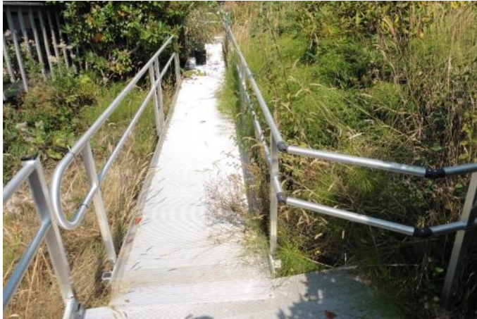
43' Ramp with 3 Platforms Awaiting Disassembly