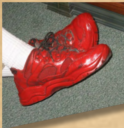
MYRON'S DAINTY SHOES