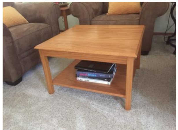
Leonard Hale built this table for the house