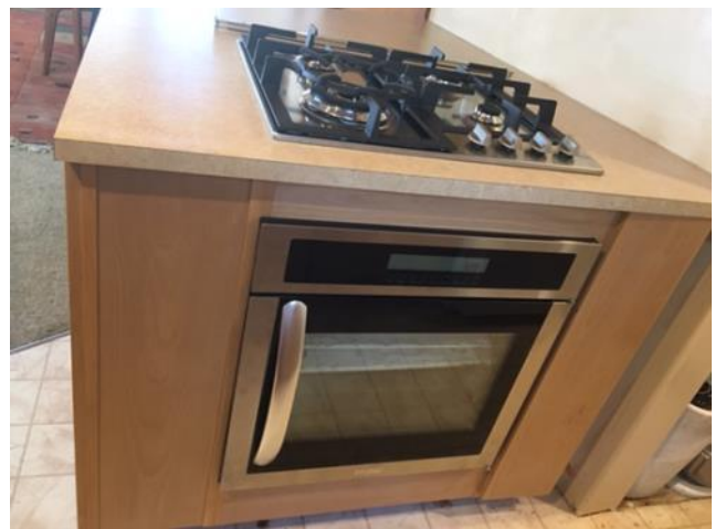
The cabinetry was hand-crafted in his woodworking shop.