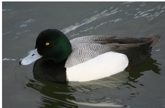
The greater scaup, or "Bluebill."

Bluebills as a volunteer organization www.bluebills.org came into being in 1995. "We don't work for paychecks these days, except the kind of payoff that rewards us with a warm glow of satisfaction. We are at work on projects that are making our communities better places to live."