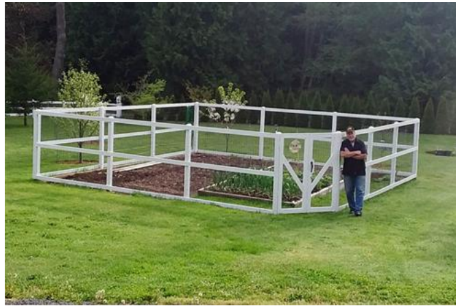
John White installed gutter filters and got the garden and yard clean and green (and fence white)