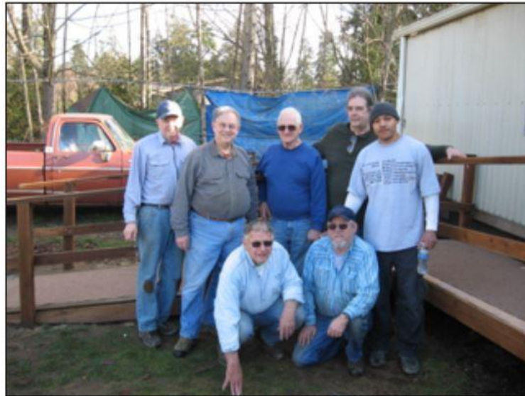
Port Orchard Ramp Build, March, 2010.