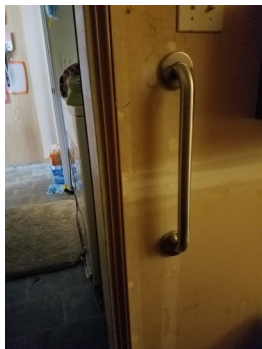
Grab bar for Port Hadlock woman who had fallen down the steps into her garage.