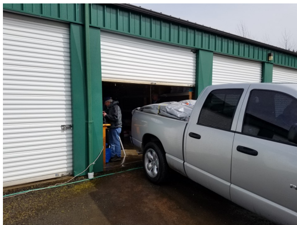
Loadout to Kitsap and an unusual, stationary shot of Ed Berthiaume.