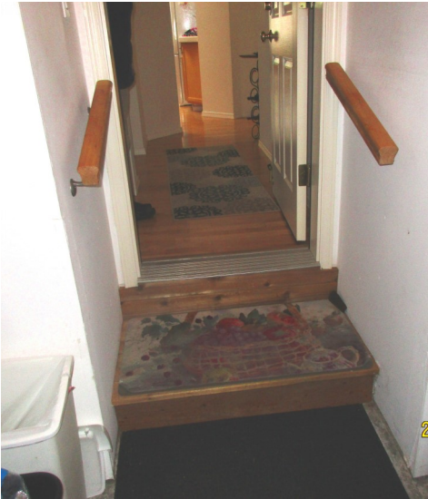
The steps from the garage into the house. It would be difficult to navigate these in a wheeled walker.