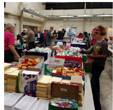
Photos from last year's Operation Christmas Child