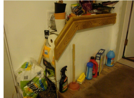
Small project complete, inside railing and outside railing.