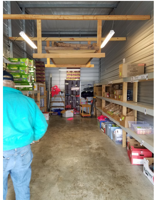
A rare look at the (nearly) empty Bluebill World Vision storage container in Chimacum.