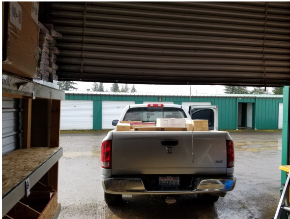
Loaded up for Kitsap!