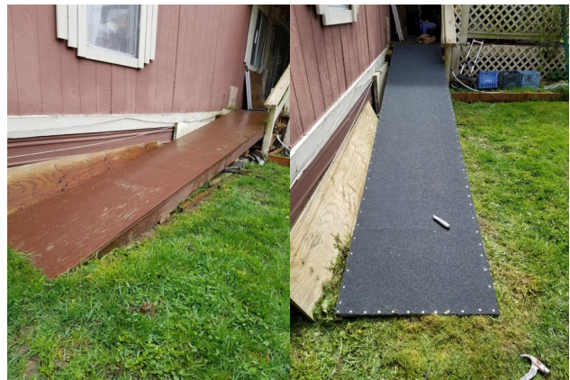
Grab bar installations and non-skid surface installed in client's home in Port Townsend. Jim Mueller