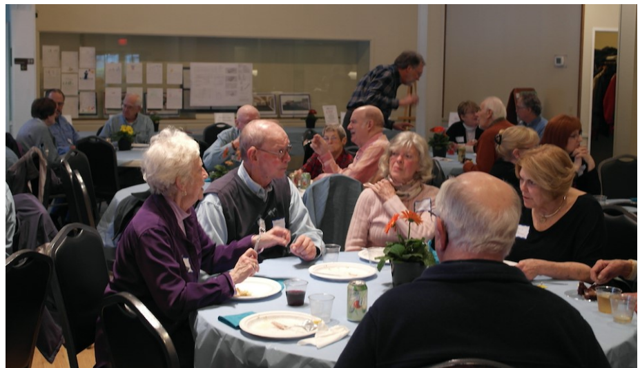
Bluebills being social