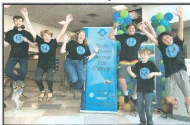
Sea Dragons MATE ROV Team