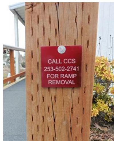
Ramps are tagged with number for Catholic Community Services