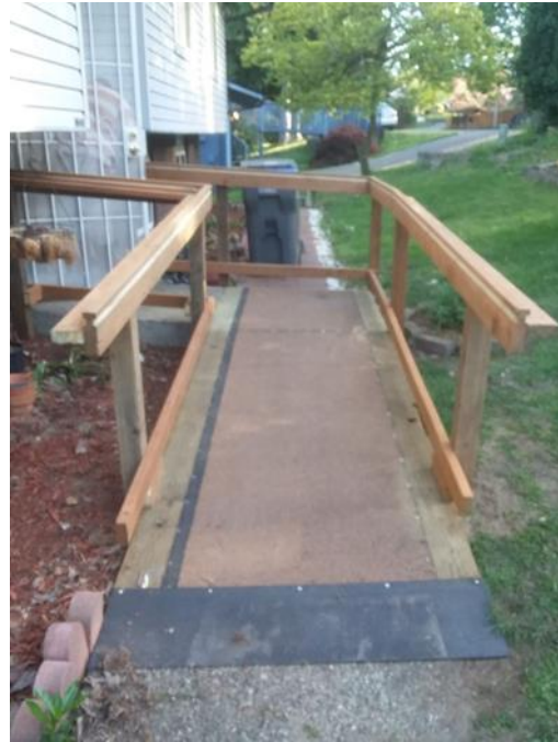
Ramp at its new location in Bremerton