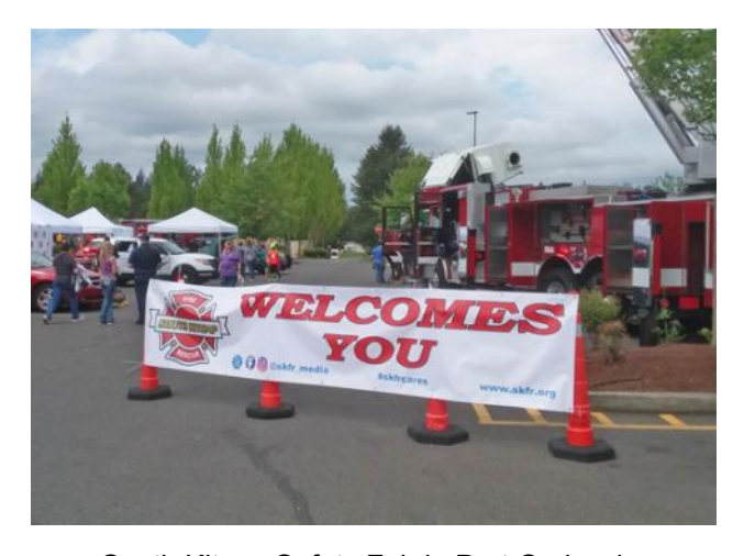
South Kitsap Safety Fair in Port Orchard

With the help of Lutheran Community Services, we recently established a process whereby Fire and Rescue can refer clients to Bluebills so that we can provide fall prevention and independent living services to those in need. Referrals are routed to us through Kitsap County Aging and Long Term Care, which is a division of Kitsap County government and is the state-designated Area Agency on Aging for Kitsap County. These referrals are just starting to come in, and we responded with fall prevention services to 3 of them in May.