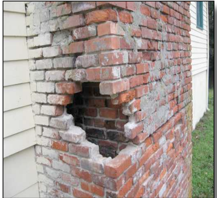
This large hole in the side of the Girl Scout House chimney let in a draft and made the integrity of the chimney questionable.