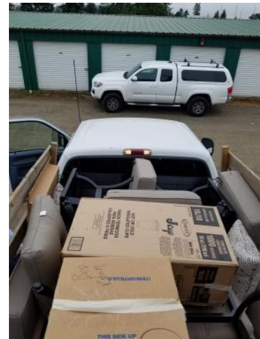
Packed to the gunnels