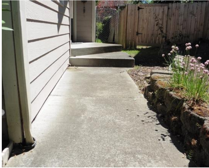
Concrete Steps with no Railing