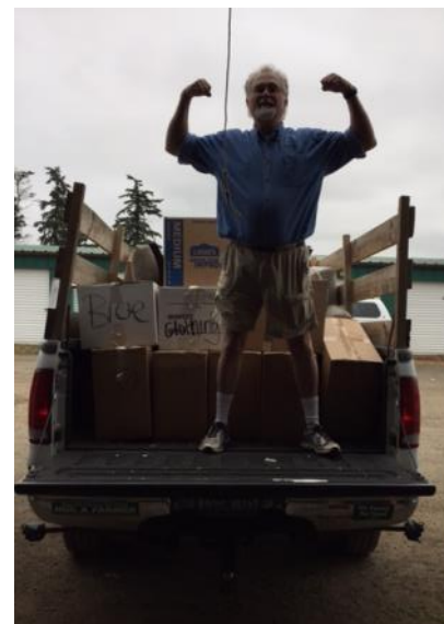
BB Essential Supplies loaded for Kitsap