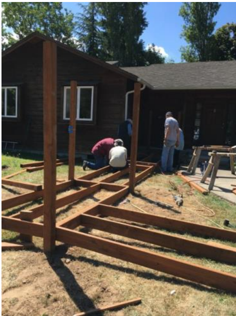
The team hard at work