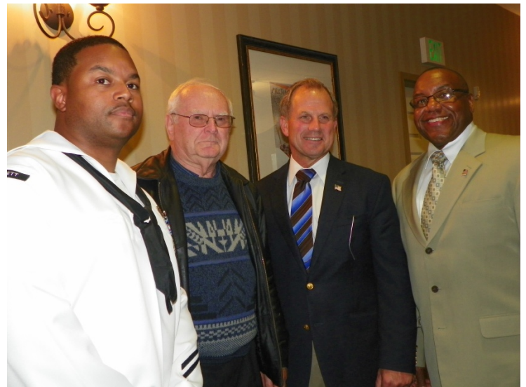
Also at the Gala