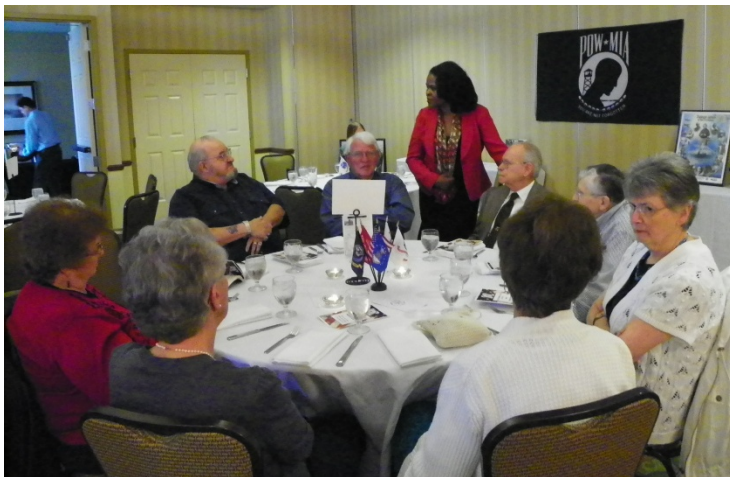
Bluebills attending the Tuskegee Airmen event