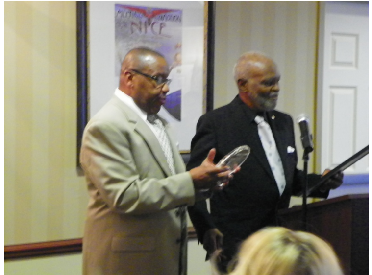
At the Tuskegee Airmen Gala