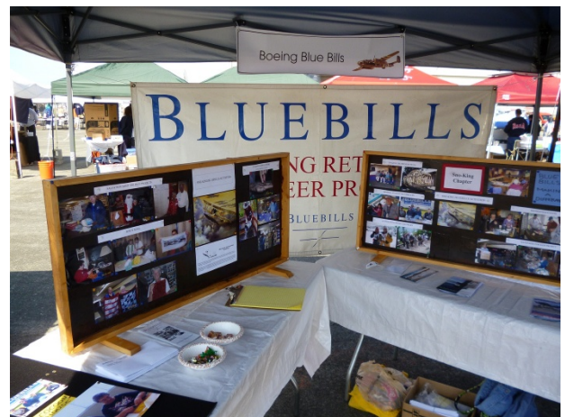
The Bluebills Display in our booth at the show