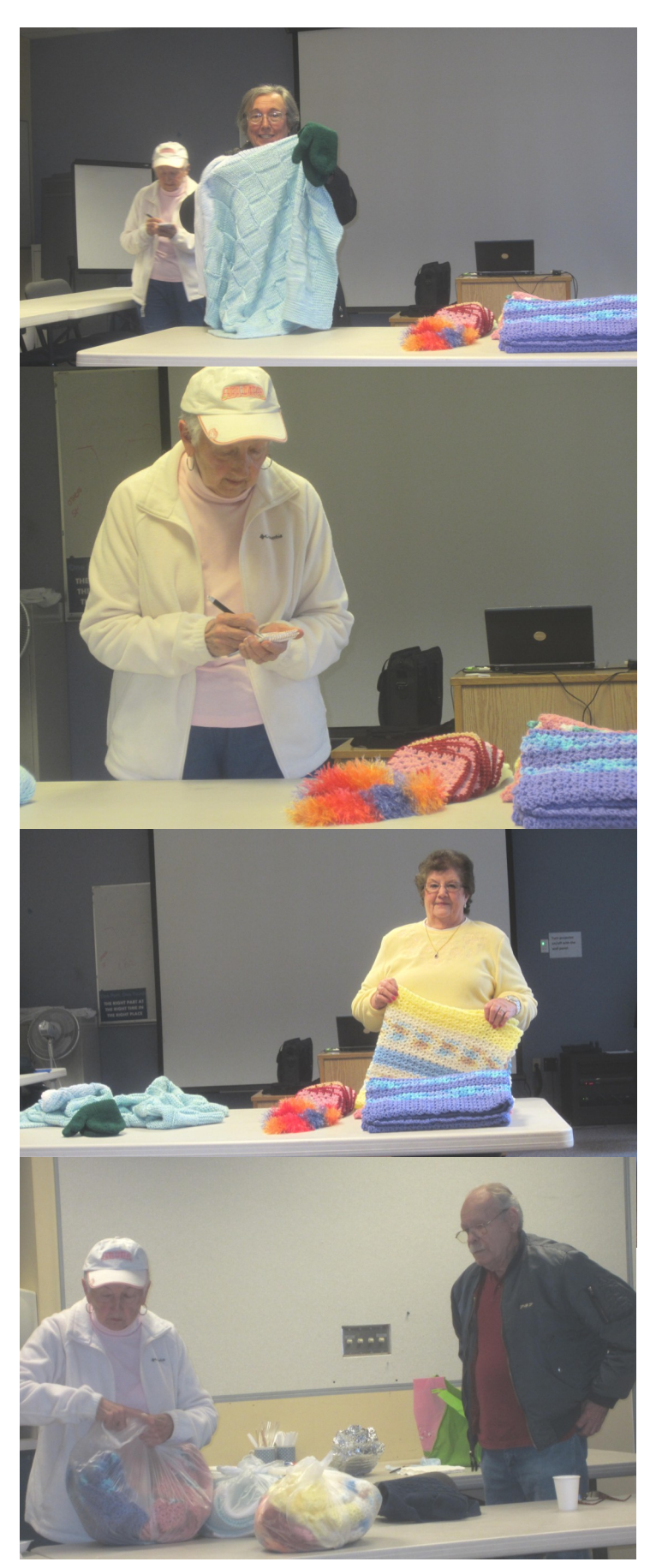
Left: Meeting prep photos; above: Sew 'n Sew donations in February