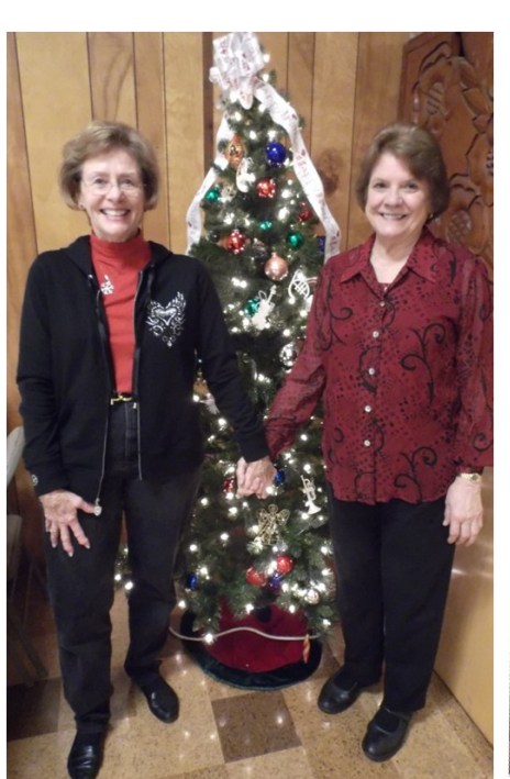
Christmas Potluck VFW Post 1263, Renton, WA