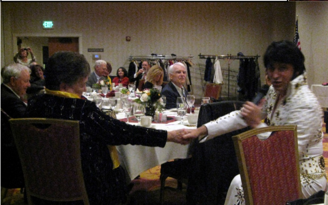
Elvis Wowed the Ladies!